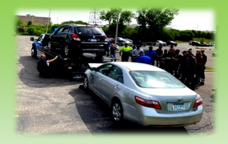
MPTA Board Directors sponsored the event providing many vehicles and the use of their equipment. Promising the students, they will get hands on training while getting dirty- just like every MPTA sponsored towing training session. Every school the MPTA conducts, all of us learn more from the instructors as well as from our students.