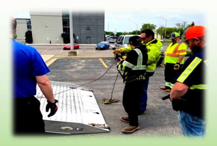
Thank you to the MPTA Board Directors for their time and knowledge! Together we continue to support our industry but more importantly, our professionalism one training class at a time!

Hope to see you or your employees at the next MPTA/Nationwide Insurance endorsed training class!